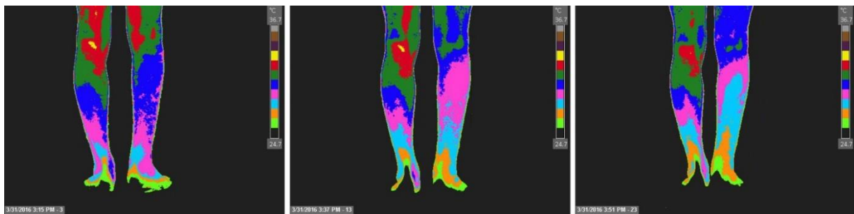
Image 1 Impact of cold pressor challenge testing upon the right lower extremity. The longer the limbs are exposed to cold stress (from left to right) the more obvious the asymmetry pattern becomes.

While sympathetic skin response testing and cold stress studies can provide clear utility in veterinary medicine, especially as it relates to assessment of autonomic impacts on the musculoskeletal system, due to the inherent nature of the subject matter, greater latitude must be afforded to the interpreting